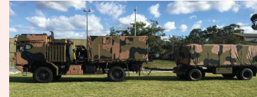
LAND 121 3B & 5B